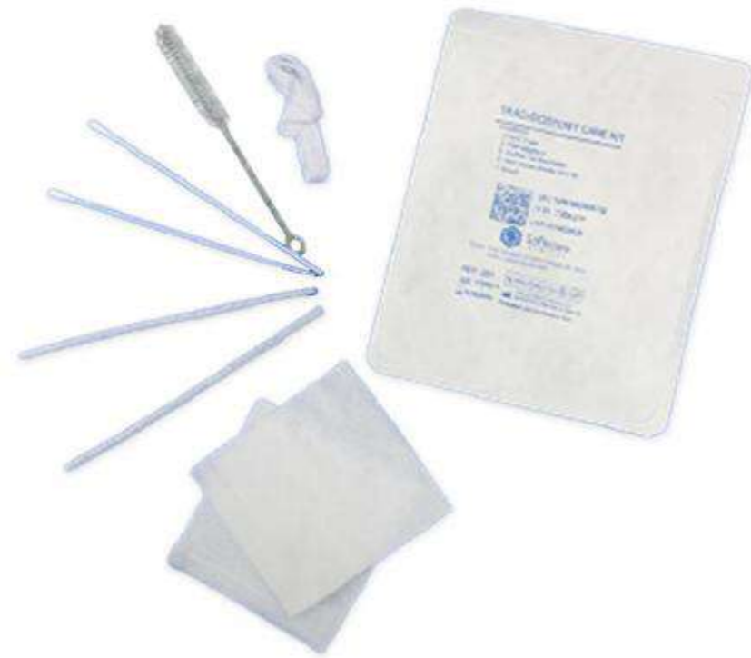
REF NO: 301