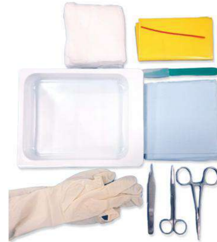
REF NO: 42-001